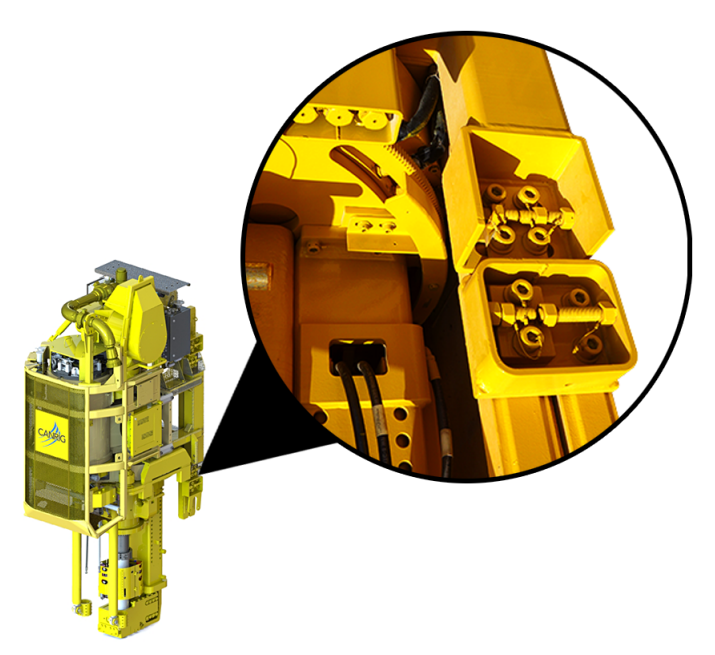
Figure 2: Adjustment Bolts on Guide Runner Assembly for Canrig 1250 Models