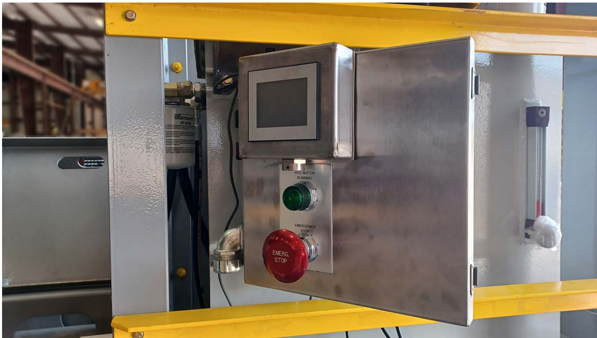
Figure 2: HMI with adapter mounting installed on a PC3000 control console

The new HMI uses the same signal and power wires already in use on the old HMI, only requiring relocating them from the old connectors to a new connector so there is no need to perform any other hardware or cabling modifications. Note that the new connector is screw-terminal only, there is no longer any soldering required inside the control console.